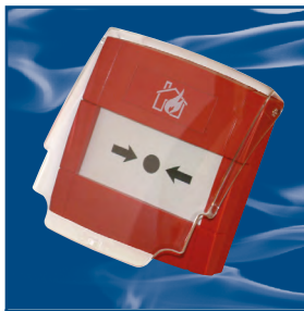
MCP Hinged Cover

Fitting a transparent hinged cover to a call point provides additional protection from accidental operation. They are particularly useful in high traffic areas such as stairwells and corridors in schools and public buildings, where the volume of traffic can result in accidental operation of the call point causing nuisance alarms.